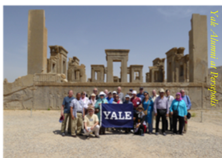
Yale - Museum of Persipolis